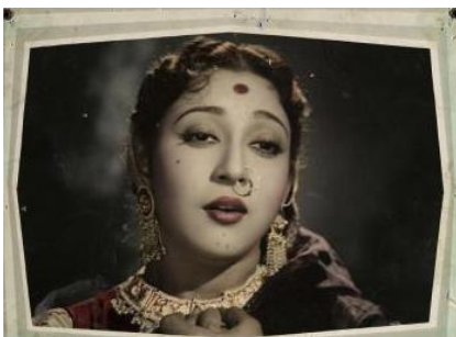
Lobby card (1959): 2004.60.23

Over 200 South Asian works of art are searchable online now that the ROM has launched its digital collection, an online presentation of objects from the Museum's encyclopedic collection of art, culture and nature. This new digital initiative gives audiences greater access to the Museum's collections and the opportunity to explore, discover and research its digitized collection at any time of day, and from anywhere in the world. Featuring 10,000 digitized objects, the online collection will grow to 80,000 by the year 2022.