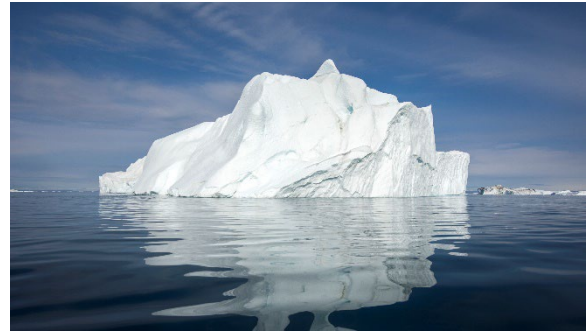
Figure 9: An iceberg in Disko Bay, Greenland.