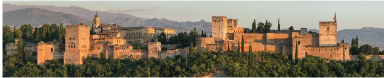
Figure 12: The Alhambra, Granada, Spain.

As we walked the parade route to the welcome dinner, our group received a rousing applause from the gathered crowd awaiting the arrival of the victorious Barcelona football team. Thus began a whirlwind trip to visit the Roman and Moorish past of Spain. We saw exquisite Roman mosaics, amphitheatres, theatres; we toured superb museums, and we learned so much about the rich history of this beautiful country.