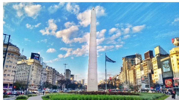
Figure 11: Obelisk, Buenos Aires, Argentina.