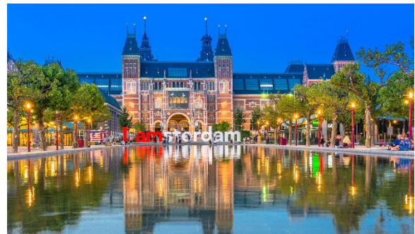
Figure 8: Rijksmuseum, Amsterdam, The Netherlands.

Eric Morrison 416.691.6770 morrison.eric07@gmail.com