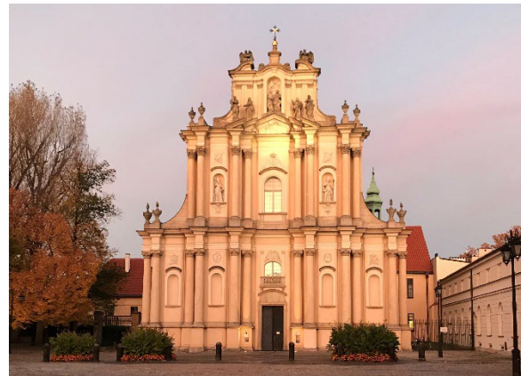
Figure 10: Visitationist Church, Warsaw, Poland