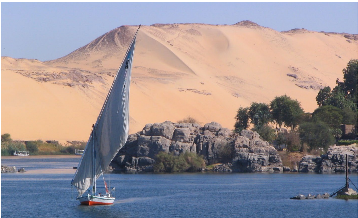
Figure 1: A felucca sailing the Nile near Elephantine Island, Aswan, Egypt.

Egypt, a country poised as a bridge between Africa, Europe, and Asia for many millennia, beckons us to tread in the footsteps of its people, both ancient