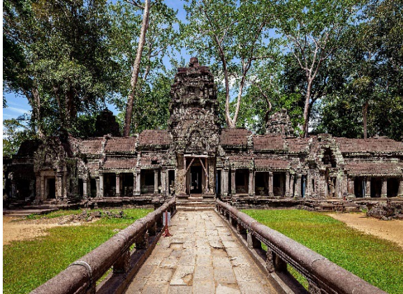
Figure 7: Ta Prohm, Angkor Wat, Cambodia.

Immerse yourself in the rich history and culture of Thailand, both ancient and modern. Explore Angkor Wat, Cambodia's temple city and a UNESCO World Heritage site.