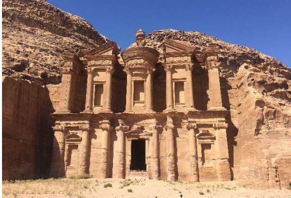
Figure 2: The Monastery, Petra, Jordan.

– invites us to explore the valley through which Moses is said to have led his people to Canaan.