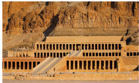
Figure 3: The Funerary Temple of Hatshepsut, Valley of the Kings, Egypt.

Please contact the Coordinator to register for an information meeting on Wednesday, November 15, 2023 at 5:30 pm EST. In-person attendance is at capacity. A wait list for video conference attendance is available.