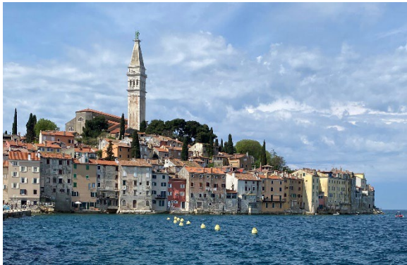
Figure 4: View of Old Town, with bell tower of the Church of Saint Euphemia, Rovinj, Croatia.

The rich history, culture, and natural beauty of Croatia awaits on a remarkable 15-day odyssey. From Dubrovnik to Istia, discover the essence of the Adriatic, exploring Roman ruins, Byzantine churches, and Venetian palaces as well as UNESCO World Heritage sites in Dubrovnik, Split, Sibenik, and more. This exclusive adventure is guaranteed to deliver unforgettable experiences and lasting memories.