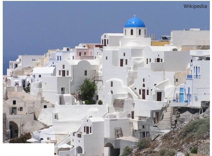
Oia, second largest town on the island of Santorini

Mycenae, makes history come alive. Here lived the hero Agamemnon, who, according to Homer, led the Greeks against Troy.