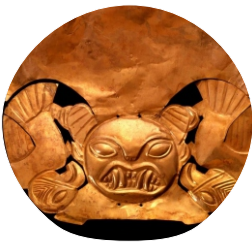
Mochinca Headdress Wikipedia