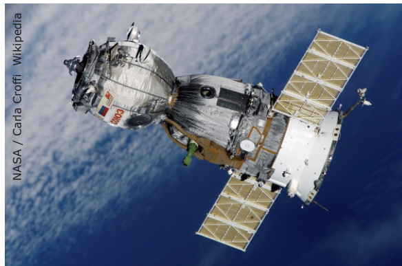
TMA Spacecraft capable of ferrying three cosmonauts to and from the International Space Station.