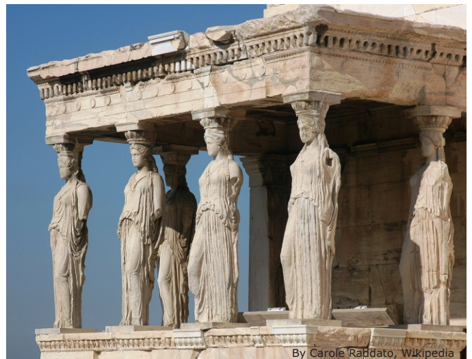
Porch of the Caryatids, the Erechtheum, Acropolis of Athens

In Athens, the Acropolis, with the ancient Parthenon, looks down over the city. We will dine in the shadows of the