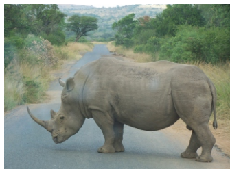
South African Rhinoceros