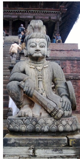
Phatta statue, Nyatapola Temple, Bhaktapur, Nepal.