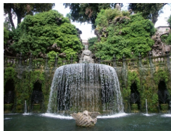
Oval fountain at the Villa d'Este, Tivoli, northeast of Rome. By Dnalor - Wikimedia