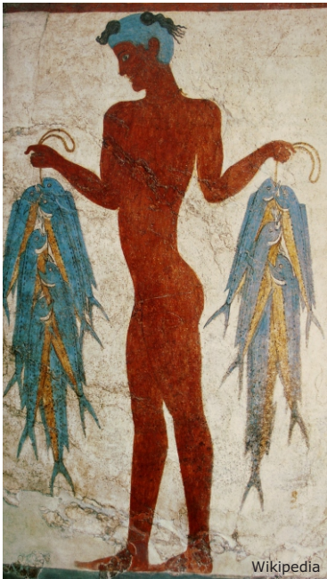
Bronze Age fresco at Akrotiri, Santorini, preserved by a volcanic eruption in 1627 BC