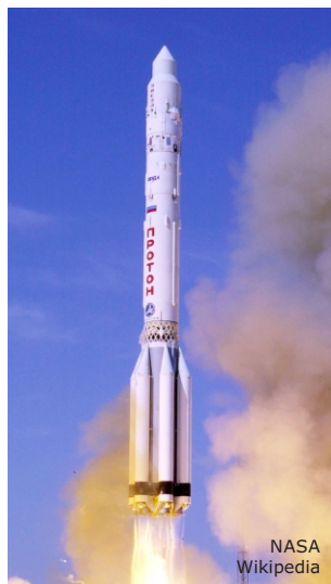
Proton-K rocket launch of the Zvezda service module of the International Space Station.

In Moscow we will delight in the beauty of the Kremlin and of fanciful St. Basil's cathedral.