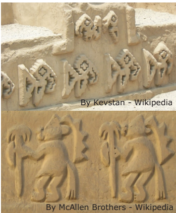
By Kevstan - Wikipedia