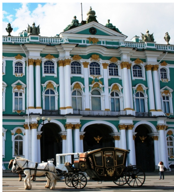
The Winter Palace, site of the Hermitage Museum, St. Petersburg.

At the Hermitage Museum in St Petersburg enjoy a private tour of that great museum's art collection. The city is one of the grandest in Europe, full of canals, cathedrals and palaces.