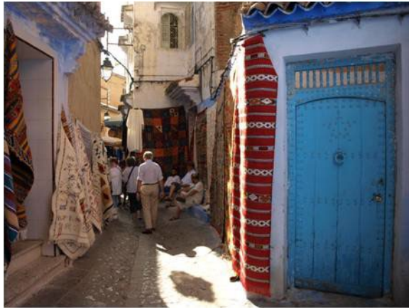
Figure 4: Chefchaouen, Morocco.

Drive to Tetouan, where we will visit the medina, Archaeological Museum, and have lunch. Continue to Chefchaouen, "The Blue Pearl of Morocco" and a walk in the medina.