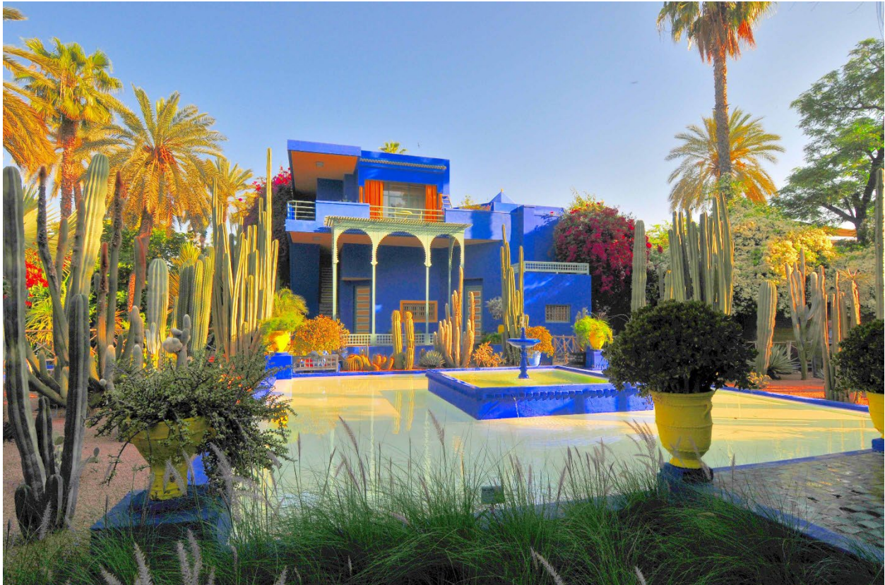
Figure 10: The Pierre Berge Museum of Berber Arts at the Majorelle Garden, Marrakech, Morocco.

https://www.rom.on.ca/en/join-us/membership/become-a-member