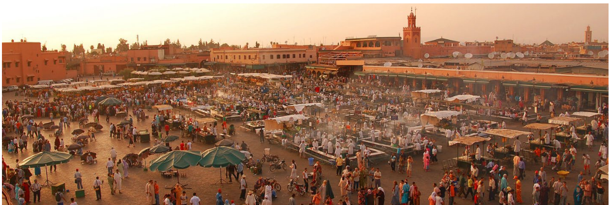
Figure 9: Jemaa el Fna Square, Marrakech, Morocco.

TICO Registration Numbers 2667946 and 1667953