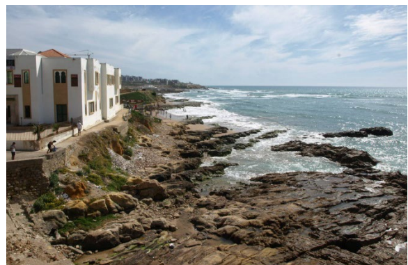
Figure 3: Looking south from Cap Spartel, Morocco.

Drive to Tangier with stops at the Punic-Roman site of Lixus, Asilah's medina and murals, the Caves of Hercules and Cap Spartel.