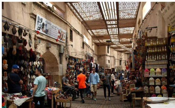
Figure 7: Walking in the medina of Marrakesh, Morocco.

Tours of the Majorelle Garden, Berber Arts, Yves Saint Laurent (YSL) and Dar El Bacha Museums. Lunch will be at the famous La Mamounia Hotel. Remainder of the day free.