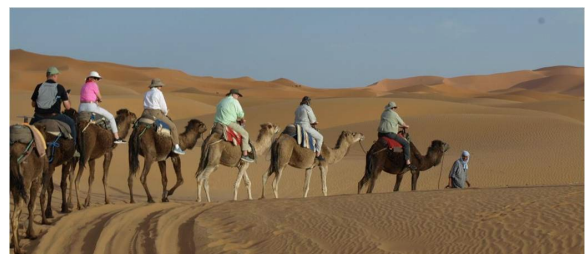
Figure 6: Sunset camel ride on the Merzouga dunes, Morocco.

Visit an Amazigh village and learn to make "medfouna" for lunch. After a sunset camel trek, arrive at the camp for dinner and traditional music.