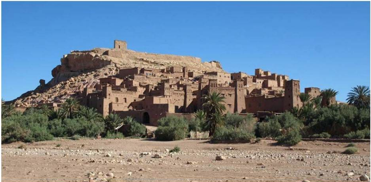
Figure 1: Ksar of Ait Ben Haddou, Morocco.

What does Morocco make you think of? Romantic medinas, colourful markets, the Atlas Mountains, snake charmers in Marrakech, camels in the Sahara Desert? We'll see all of these and much more as we explore the best this wonderful country has to offer. The trip will feature exclusive tours and less-visited sights. A series of local guest speakers will enrich our experience.