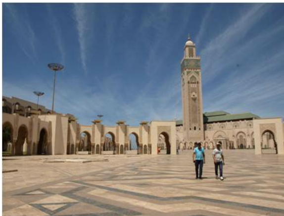
Figure 2: Hassan II Mosque, Casablanca, Morocco.

Morocco's justifiably famous cuisine will be featured throughout the trip, and we'll enjoy a variety of entertainment including traditional music. Do join us. It will be unforgettable!