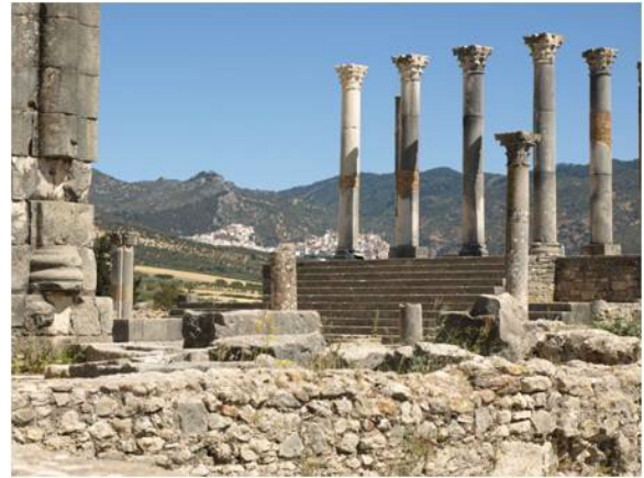
Figure 5: Volubilis, Morocco.

Day trip from Fes for a walking tour of the Roman site of Volubilis, with its wonderful mosaics. Tour of the Imperial City of Meknes. Lunch and wine tasting at Chateau Roslane.