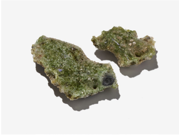
Trinitite (fused silica), created with the first nuclear explosion (Trinity Test, Los Alamos, NM, 1945, photo on far left)