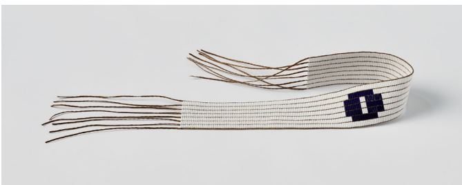
Replica of Dish With One Spoon Wampum belt

Great Acceleration (since 1950s): The mid 20 th century acceleration of social and economic drivers resulted in a massive increase in the burning of fossil fuels, as well as ecological changes associated with introduced species, all captured in lake sediments.