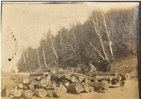
Photograph of lumber in southern Ontario, late 1800s/early 1900s (Crawford family)

Sawmill (late 19 th Century): In the late 1800s, the Crawford family from England built a sawmill near the lake. The record of the lake captures this event, paired with broader regional clearcutting by settlers.