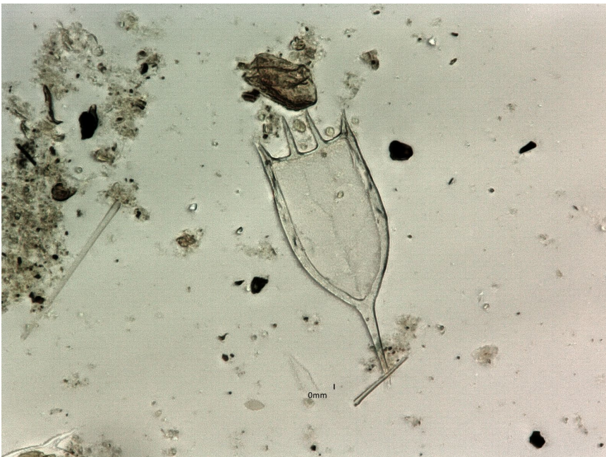
Original microscopic imagery of historical microorganisms, pollen, and other records captured in the lake's sediments are incorporated into digital interactives, revealing timelines of change.