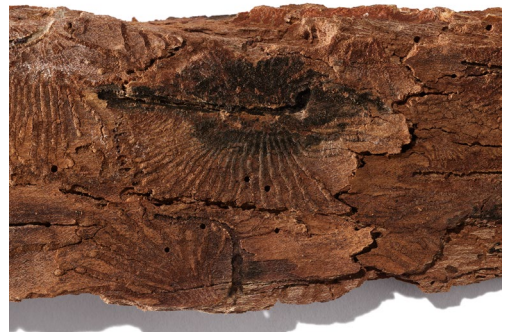
Close-up of fungus causing Dutch Elm Disease

Sawmill (late 19 th Century): In the late 1800s, the Crawford family from England built a sawmill near the lake. The record of the lake captures this event, paired with broader regional clearcutting by settlers.