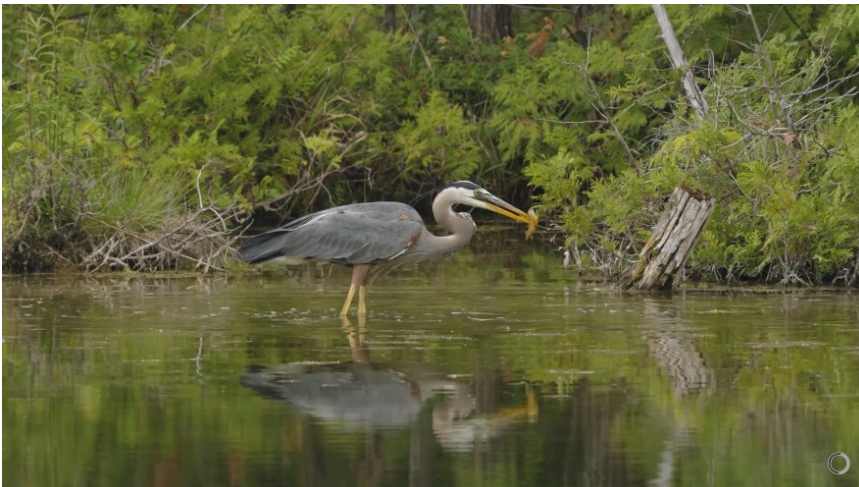
Still from immersive video installation "A Year at Crawford Lake".

A central column in the space introduces visitors to the core, teaching them about why the lake is so special, and inviting them to explore its history with a digital interactive interface. A nearby audio-video installation immerses visitors into the experience of visiting the lake.