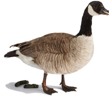
Canada goose with poop

The core reveals crop pollens transported to the lake by Canada geese, evidence of human farming activity at Crawford Lake by Indigenous Ancestors beginning in 1290.