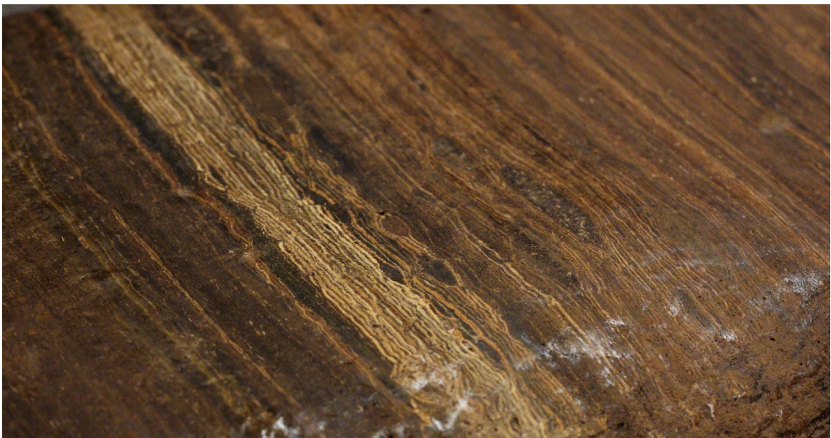
Close-up of the Crawford Lake core layers, or "varves".

The exhibition opened at ROM in September 2025 and will be available to tour starting in Fall of 2026.