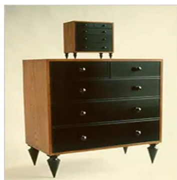
Gord Peteran, Chest on Chest , 1984