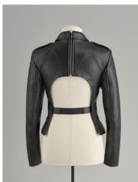
Izzy Camilleri, Leather Jacket , 2018

Post-Modernism and Beyond: The 1980s saw the return of colour, decoration, and historicism — the tenets of postmodernism. Canadian designers continue to innovate in the global marketplace, drawing upon a wide range of cultural sources and technologies to address contemporary issues such as the environment and universal design in meaningful ways. For example, Izzy Camilleri's Leather Jacket was designed to accommodate wheelchairs.