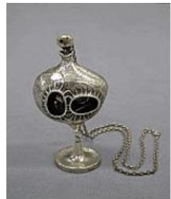
Guy Vidal, Pendant with "moon rocks", c. 1970s