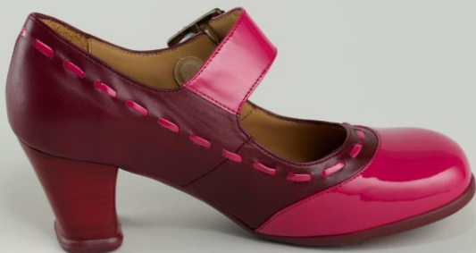
John Fluevog, Dr. Henry Limited Edition, J2020, Patent leather