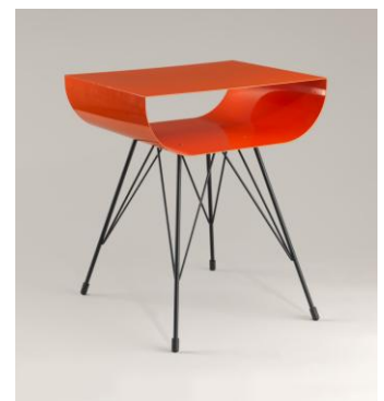
Johnny Lim, Star 69 Side Table , 1998