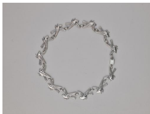
Carl Poul Petersen, Bird Necklace