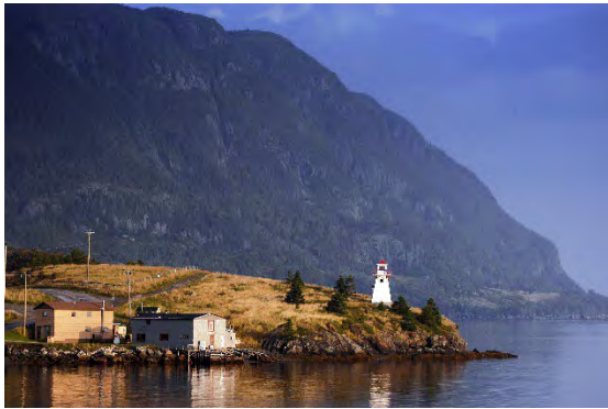
Figure 8: Gros Morne National Park.

Gros Morne National Park's Tablelands, a 600-metre (1,967-foot) plateau, forms one of the world's best examples of exposed mantle. Normally found below the Earth's crust, the mineral-rich rocks support very little life, making the Tablelands an eerie landscape.