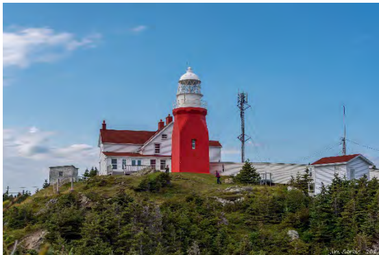
Figure 10: Long Point Lighthouse, Twillingate.

Photographers will have their work cut out for them, as they capture all the special charm of classic island communities and stunning coastlines.