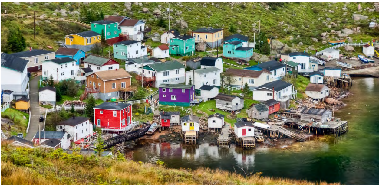
Figure 3: Francois.