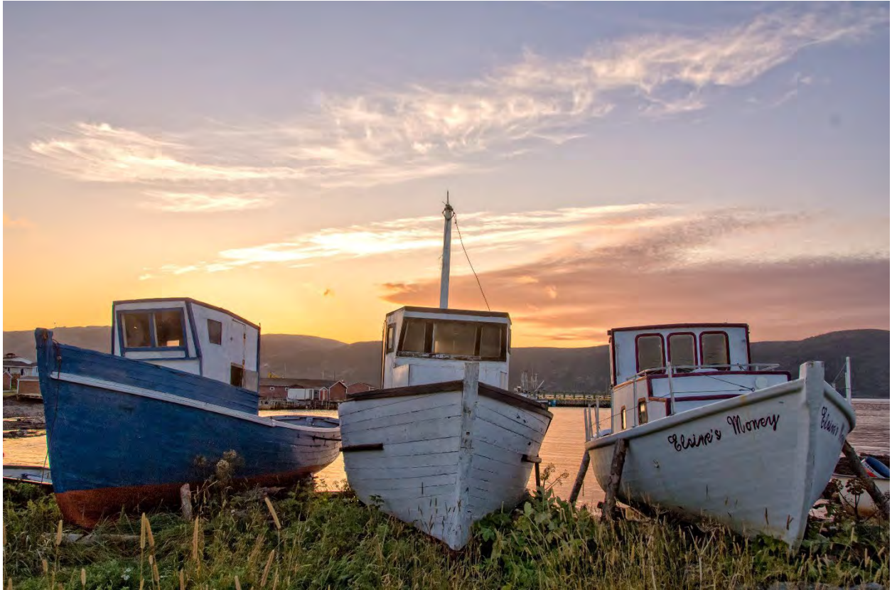
Figure 11: Boats pulled onto the shore.

ROMTravel is organized by ROM's Department of Museum Volunteers to provide support for the Museum. ROM is an agency of the Government of Ontario.