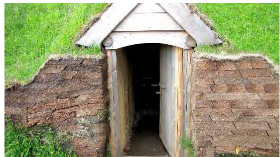
Figure 9: Entrance to a sod house, L'Anse aux Meadows.

L'Anse aux Meadows, a UNESCO World Heritage site, is the only authenticated Norse settlement in North America. The archaeological remains found here in 1960 date to approximately 1000 CE. Amazingly, the location was first established by a close reading of the Viking sagas.