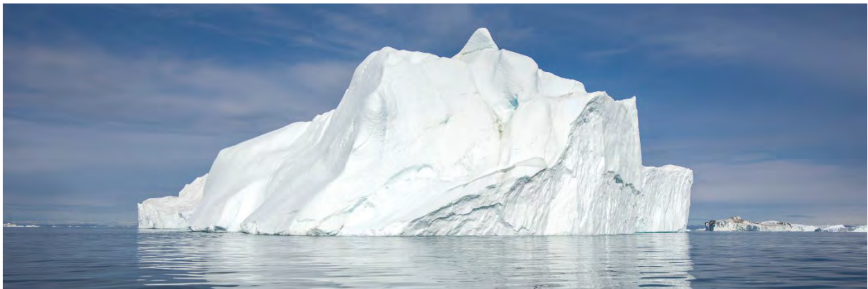
Figure 2: An iceberg in the water.