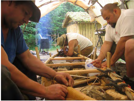
Figure 6: Birch bark canoe making, Miawpukek.

settlement sometime around 1822. Before then, it was one of many semi-permanent camps used by the Mi'kmaq people, who had traditionally travelled nomadically throughout the east coast of Canada.