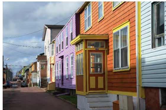
Figure 5: Saint Pierre.

French food, wine, clothing, and culture are all on offer here. The sweets at the local cafés and bakeries are in high demand. Saint Pierre offers a taste of European living, just a short sail from the coast of Newfoundland.