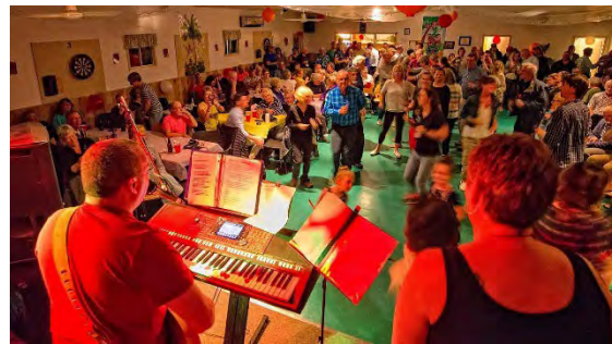
Figure 7: Kitchen party, Francois.

After a day of adventure, head to the community hall for an oversized kitchen party with treats, drinks, and dancing. Rediscover a bit of your own spirit, through the essence of Newfoundland's culture in this charming and resilient community.