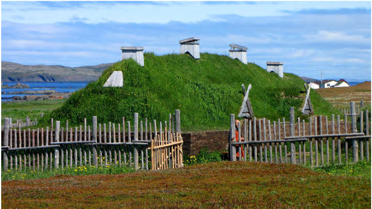
Figure 1: L'Anse aux Meadows.