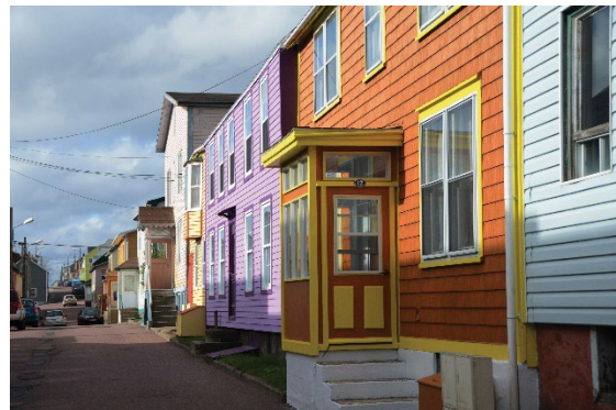
Figure 5: Saint Pierre.

French food, wine, clothing, and culture are all on offer here. The sweets at the local cafés and bakeries are in high demand. Saint Pierre offers a taste of European living, just a short sail from the coast of Newfoundland.