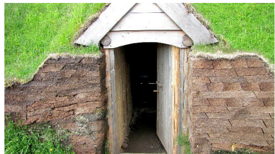
Figure 9: Entrance to a sod house, L'Anse aux Meadows.

L'Anse aux Meadows, a UNESCO World Heritage site, is the only authenticated Norse settlement in North America. The archaeological remains found here in 1960 date to approximately 1000 CE. Amazingly, the location was first established by a close reading of the Viking sagas.