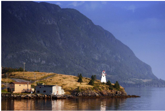
Figure 8: Gros Morne National Park.

Gros Morne National Park's Tablelands, a 600-metre (1,967-feet) plateau, forms one of the world's best examples of exposed mantle. Normally found below the Earth's crust, the mineral-rich rocks support very little life, making the Tablelands an eerie landscape.