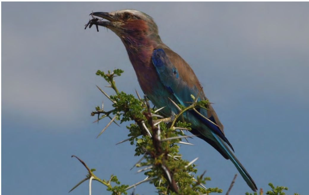
Figure 10: Lilac-Breasted Roller, Namibia.

Worldwide Quest International has specific Terms and Conditions , which you must accept when completing Worldwide Quest International's online registration form.