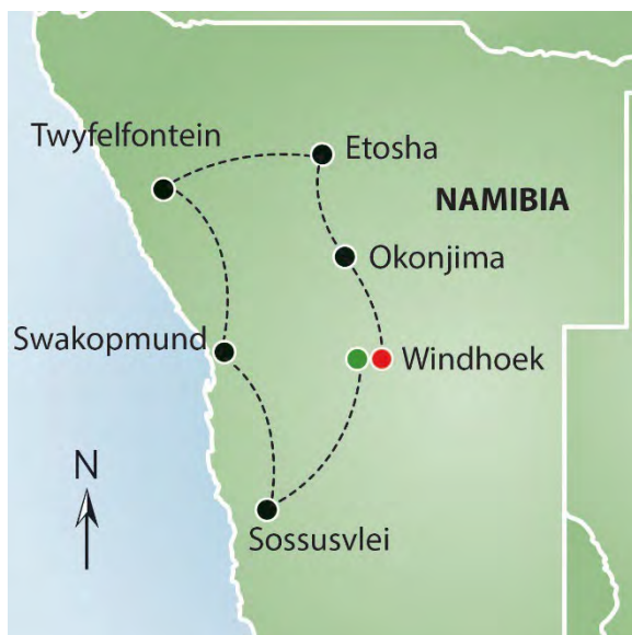
Figure 2: Map of Namibia.