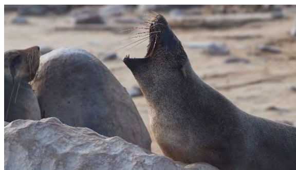
Figure 4: Cape Fur Seals, Namibia.

Today we travel to the nearby deep-water harbour at Walvis Bay for a wildlife and sightseeing cruise, keeping an eye out for seals, whales, dolphins, and Leatherback Turtles. We also explore Sandwich Harbour and the Kuiseb Delta. This evening is at leisure; in the spirit of local culture, you may decide to visit a German pub!