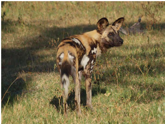
Figure 8: African Wild Dog, Namibia.

After our flight from Windhoek, Namibia to Maun, Botswana, we take a light aircraft flight into the northern Okavango Delta. Chances are good for spotting wildlife while we travel in an open safari vehicle to our camp!