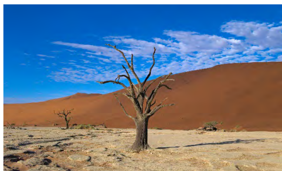
Figure 3: Deadvlei, Namibia.

We set off early to watch the sun rise over the dunes of Sossusvlei. We have a chance to walk up a giant dune, photograph the millennial dead trees at Deadvlei, and explore the Sesriem Canyon. A relaxing afternoon at the lodge awaits before dinner.