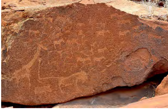
Figure 5: Lion Plate, near Twyfelfontein, Namibia.