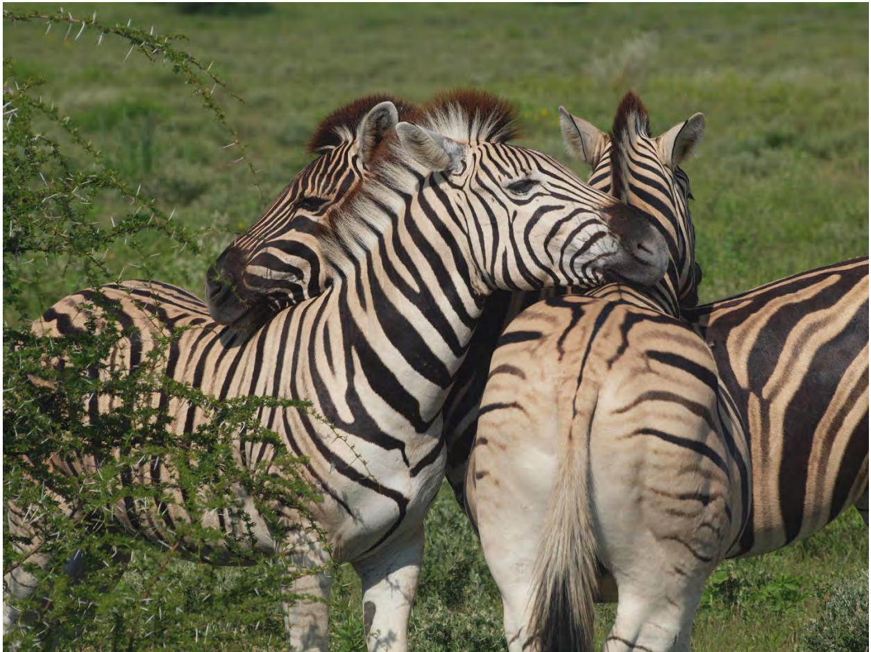
Figure 1: Burchell's Zebra, Namibia.