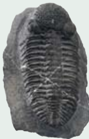
Left: A well-preserved, slightly restored example of Phacops sp. It has mineral-filled cracks that go through the rock and the fossil, usually a good indication that the fossil has not been highly restored. Devonian (370 million years old), Morocco.