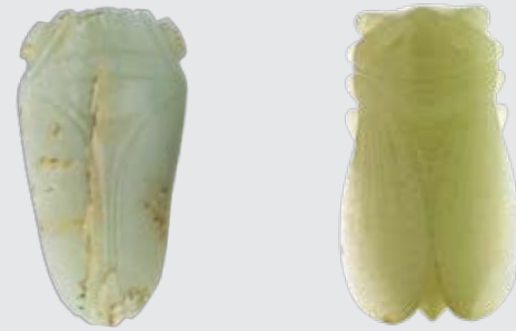
Left: Cicada, Jade, Eastern Han dynasty, 25–220 CE.