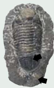
Right: Restored composite of the trilobite Phacops sp. Arrows indicate the added pygidium (tail) and the trilobite's own pygidium still partially embedded in the matrix. Devonian (370 million years old), Morocco.