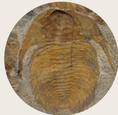
Left: A highly restored and carved specimen of the trilobite Acadoparadoxides briareus . Middle Cambrian (505 million years old), Morocco.