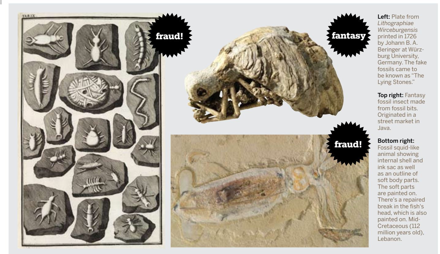
Left: Plate from Lithographiae Wirceburgensis printed in 1726 by Johann B. A. Beringer at Würzburg University, Germany. The fake fossils came to be known as “The Lying Stones.”

Another common target for fraud is amber, which has been prized for millennia for use in jewellery or amulets. Clear amber often contains the remains of insects that became trapped in the sticky resin—nature's flypaper. Incidents of fake amber abound. Look-alike amber jewellery has been made from glass and a variety of synthetic resins, and often includes insects for an “authentic” appearance.