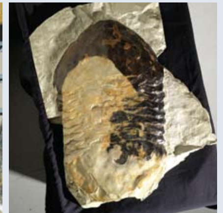
Top left: Assembling a dinosaur skeleton in 1973. Missing vertebrae (in white) were reconstructed in plaster.