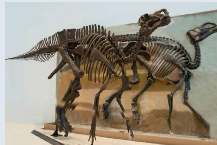
Bottom: The front dinosaur is a cast. The real bones have been set aside for research. The dinosaur at back is almost completely real fossil bone.

Amber, ROM 59296 and ROM 49367, Trilobite Phacops , ROM 59297 and ROM 45108, Trilobite Acadoparadoxides briareus , ROM 53246 and ROM 558774, gift of the Louise Hawley Stone Charitable Trust