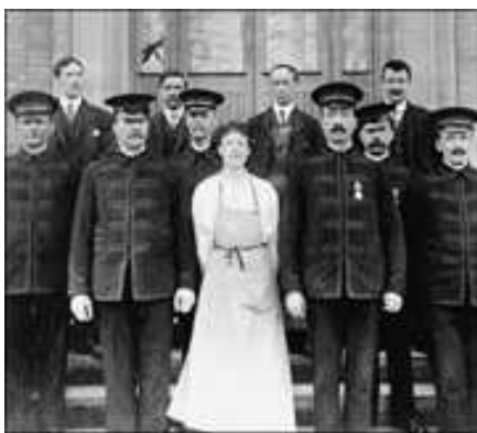
② ROM Staff 1914