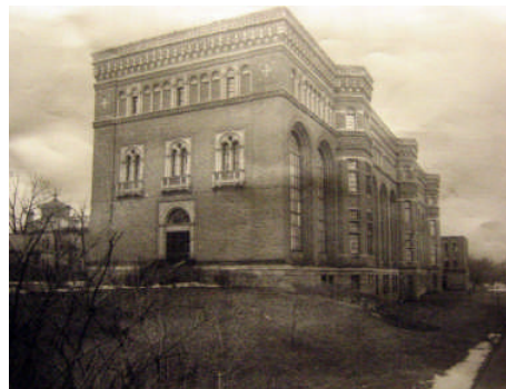
⑥ ROM 1914