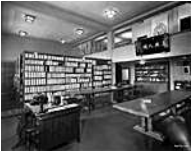
④ Far Eastern Library 1937

Earlier this year we arranged with UTL to establish two new location codes, which will appear in the online catalogue; one for the Egyptian books and the other for the West Asian books. These titles must be retrieved through the service desk in the Far Eastern Library.