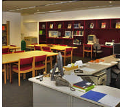
① Sackler Reading Room, ROM Main Library

The ROM Libraries have had a busy academic year, due in large part to the number of curatorial staff who have been teaching this past year. We have had a number of overseas researchers here for extensive periods as well.