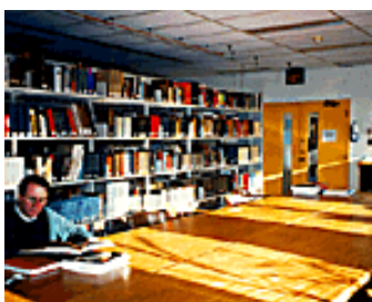
③The Far Eastern Library Reading Room