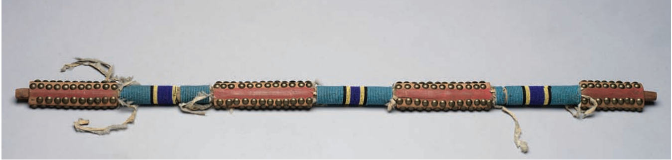
4. Pipestem collected by Maclean between 1880 and 1888. Wood, paint, brass tacks, beadwork, weasel skin. 34" long (86.4 cm). Courtesy of the Royal Ontario Museum, Toronto. Cat. No. 5539.

two missionaries eventually competed for control over the bands in the upper and lower camps, a rivalry that did not escape the notice of the Bloods.