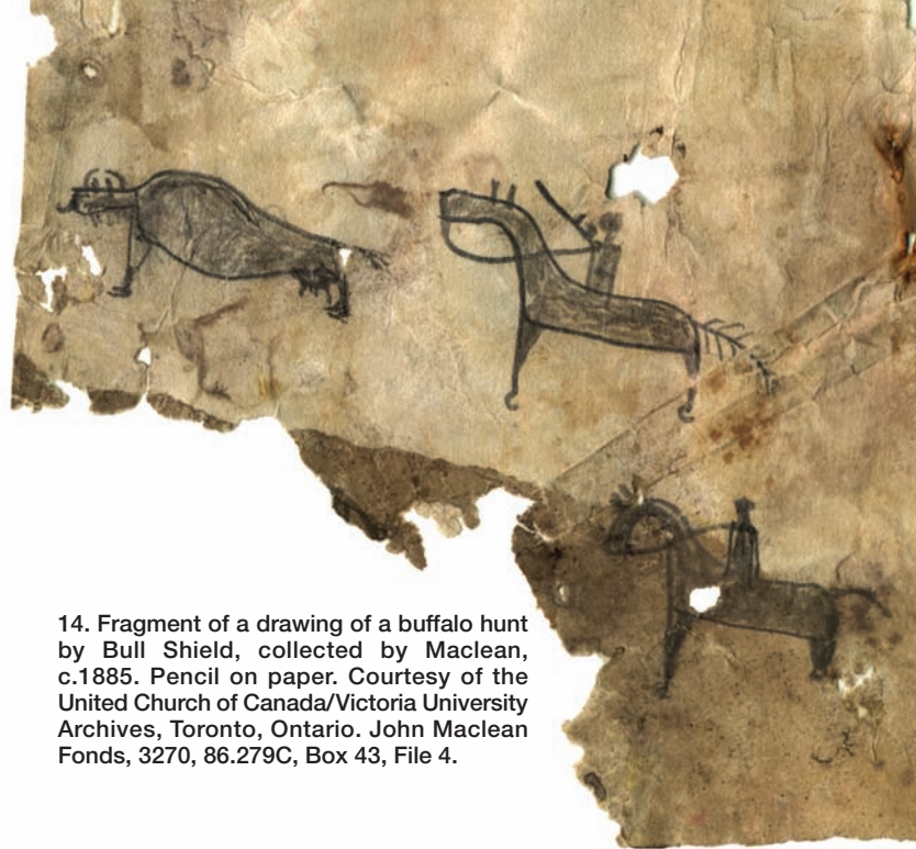
14. Fragment of a drawing of a buffalo hunt by Bull Shield, collected by Maclean, c.1885. Pencil on paper.

Although Maclean worked very hard on a Blackfoot dictionary and grammar, it was incomplete in 1889