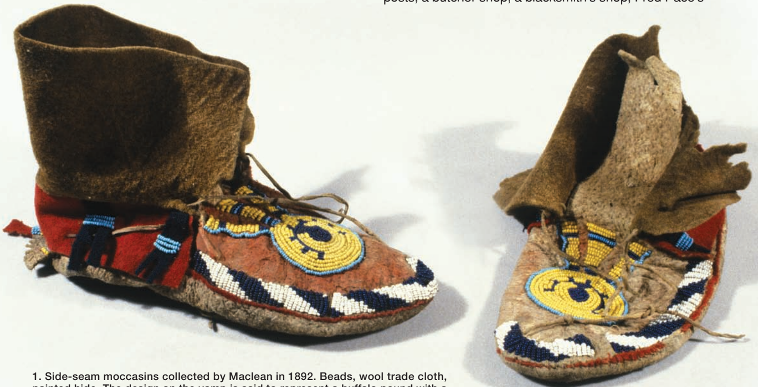
1. Side-seam moccasins collected by Maclean in 1892. Beads, wool trade cloth, painted hide. The design on the vamp is said to represent a buffalo pound with a man waving in the buffalo. Courtesy of the Field Museum, Chicago. Cat. No. 16219.