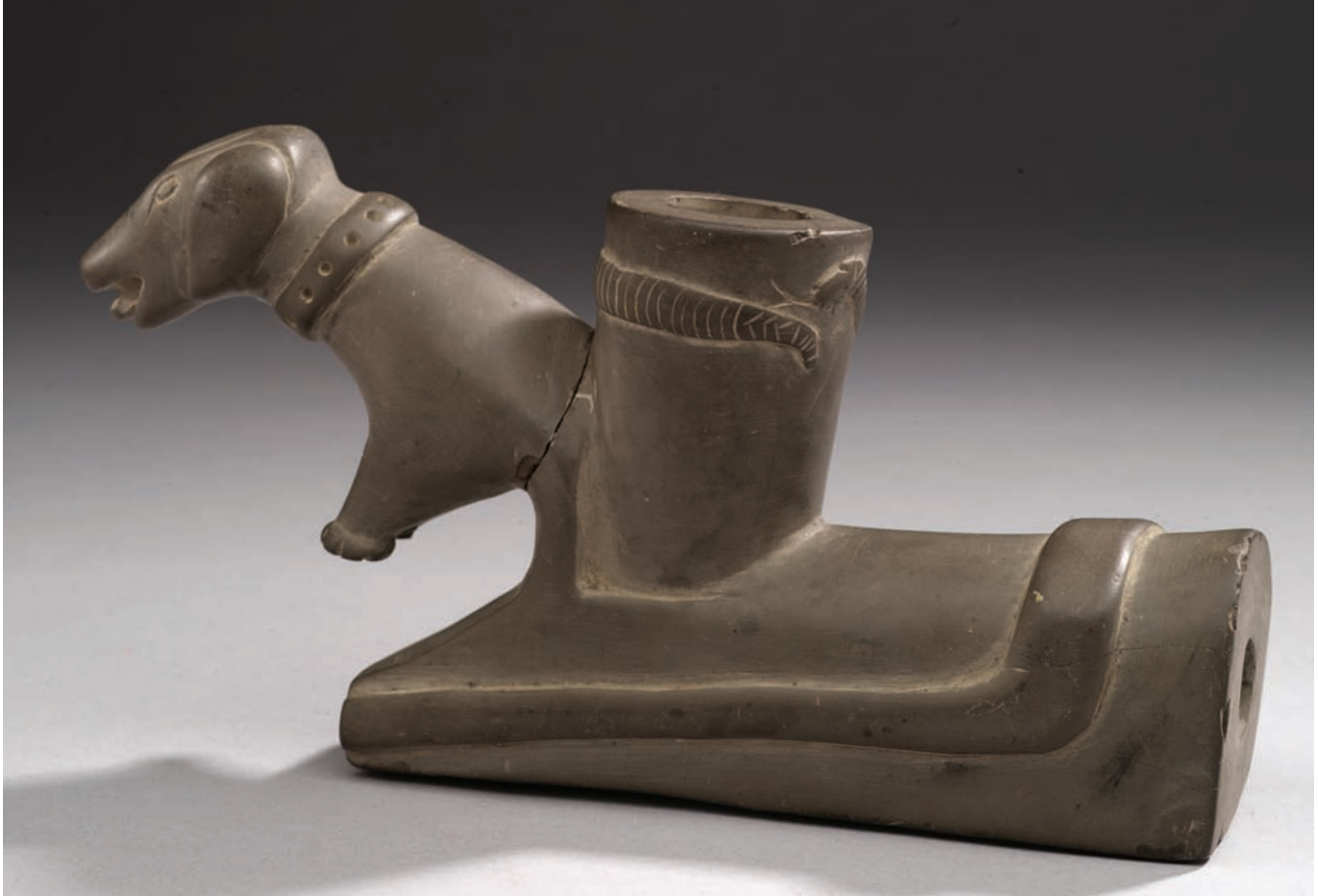
9. Pipe bowl carved before 1900, made from stone quarried on the Blood Reserve, along the St. Mary's River. 8" long (20 cm). The accompanying documentation states that it was "carved by Indian Jim at Fort Macleod, Alberta." The dog, with its prominent collar, looks like it may have been copied from the famous Gramophone Company trademark image of "His master's voice." However, that image was not disseminated around the world until January 1900, and since the pipe bowl entered the museum in that year, any similarity is likely coincidental. Cat. No. 22035.

drive lanes of the buffalo pound. A label seen by the author in the Southwest Museum, Los Angeles elaborated further, suggesting that the type of figure found in the circular part of the moccasins at the Field Museum represents "a hunter waving his arms to turn the buffalo" into the pound or over a jump (Fig. 1). Clark Wissler, the head of the Anthropology Department at the American Museum of Natural History, New York, studied beadwork patterns for symbolism. Writing to Boas, Wissler noted that