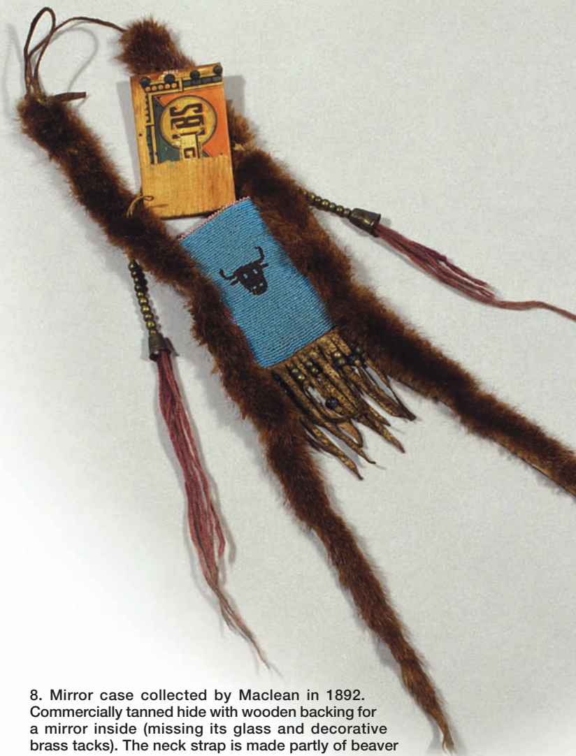
8. Mirror case collected by Maclean in 1892. Commercially tanned hide with wooden backing for a mirror inside (missing its glass and decorative brass tacks). The neck strap is made partly of beaver skin with pendants of brass beads, thimbles and wool tassels. The beaded bovine head may be either that of a cow or a buffalo. Cat. No. 16222.

Missionaries distributed bales of clothing from the East, accelerating the trend toward European clothing. Maclean was somewhat reluctant to follow this charitable practice, but felt compelled to keep up with his Anglican competitor, who was giving out liberal amounts