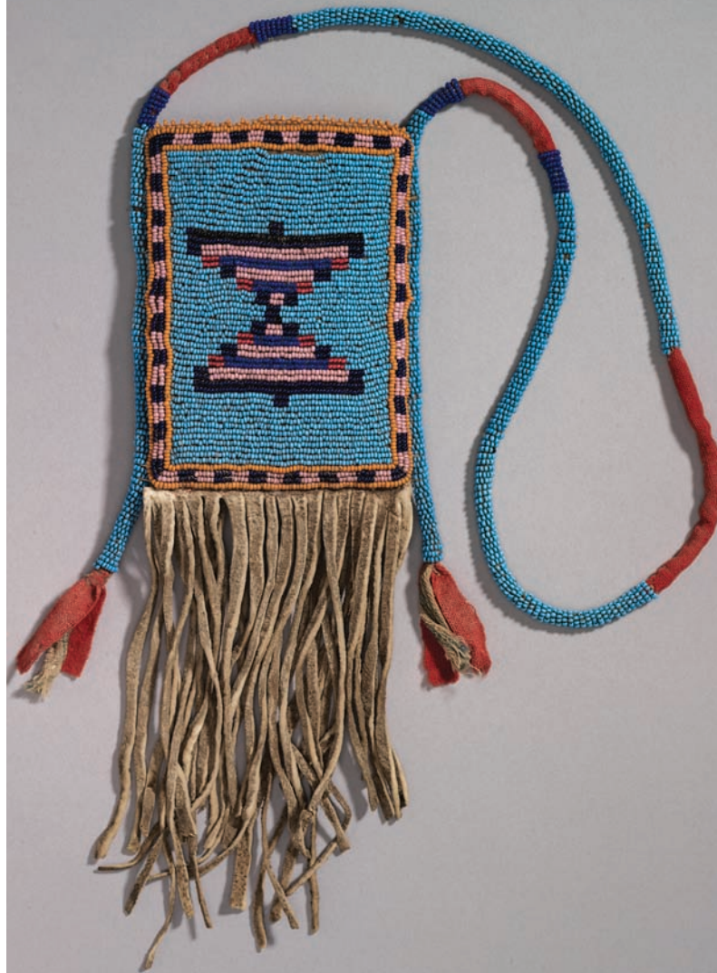
6. Mirror case with beaded wool neck strap collected by Maclean between 1880 and 1888. Inside is a mirror with an embossed tin frame. Courtesy of the Royal Ontario Museum, Toronto. Cat. No. 5509.

Boas also asked Maclean to collect Blackfoot artifacts for the exposition, again with high expectations: “I am particularly desirous of having a complete teepee with everything belonging to it and the implements, etc.