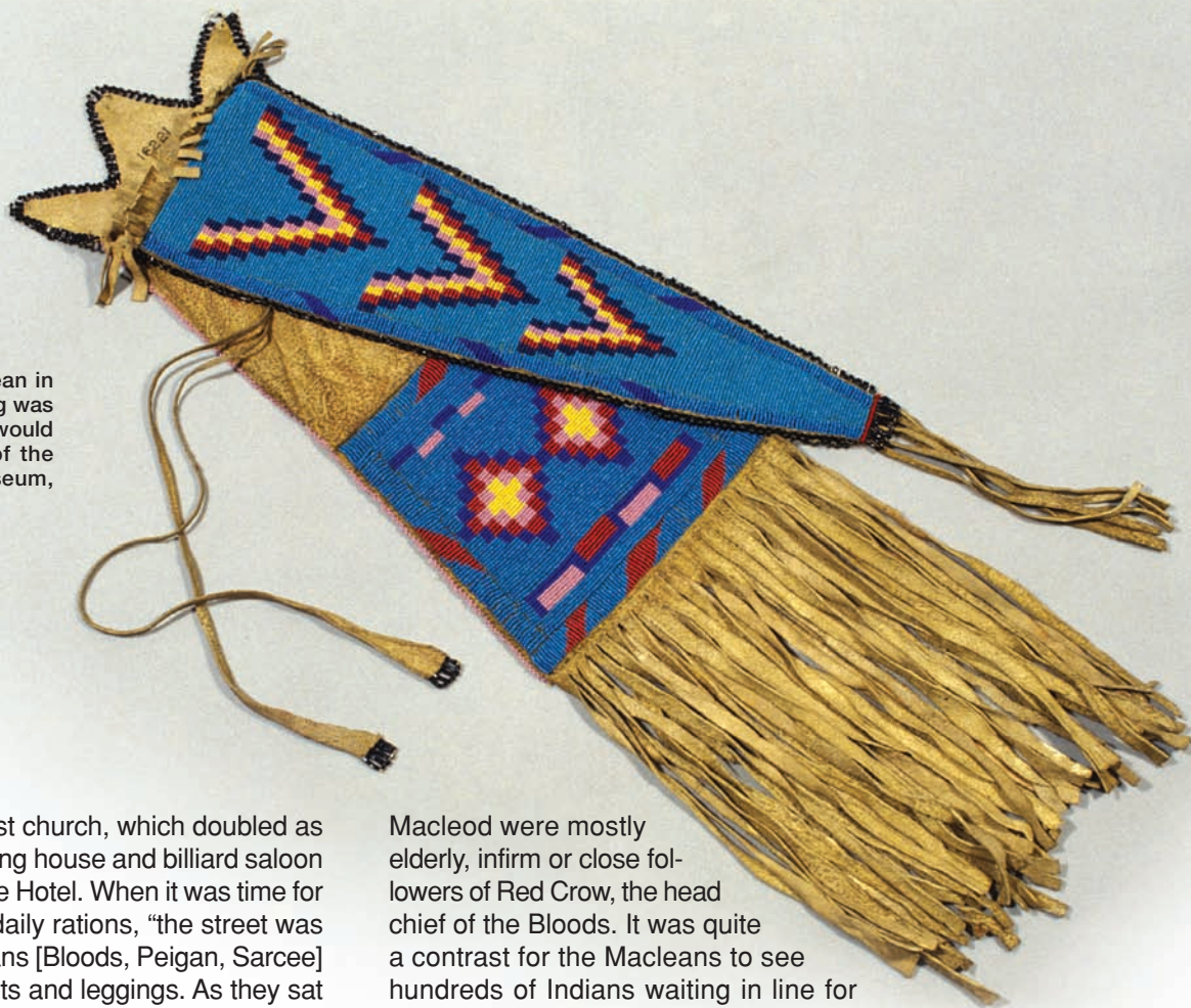
2. Pipe bag collected by Maclean in 1892. Hide, beads. When the bag was worn at the waist, the long flap would probably have fallen in front of the belt. Cat. No. 16221.

gambling saloon, a Methodist church, which doubled as a school, and a primitive eating house and billiard saloon popularly called the Kamoose Hotel. When it was time for the Indians to receive their daily rations, “the street was lined on both sides with Indians [Bloods, Peigan, Sarcee] in their many-colored blankets and leggings. As they sat on the ground smoking their long pipes, they gazed at us, and passed remarks in a language that seemed a medley of confusion, but which we have since learned to understand and admire” (Maclean 1887a:9). Intermingled were “the scarlet tunics of the mounted police, the long hair and buckskin suits of the bullwhackers, the gay attire of the half-breed women” (Maclean n.d.a). Maclean was also taken by the Western slang of the frontiersmen, “as each of the men was an artist of swearing, vying with one another as a genius in words” (Maclean n.d.a).