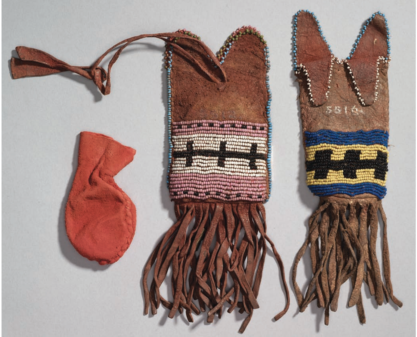
7. Bags for holding face paint, one with an inner bag containing vermilion, collected by Maclean between 1880 and 1888. Hide, beads. Cat. Nos. 5512 and 5516.

Scotland to raise funds for a new church in Moose Jaw. He arrived in England on December 1, 1891. As noted on a poster advertising his tour, Maclean offered a choice of three lectures: “Out West” was described as a missionary lecture with greater emphasis on the frontier element of southern Alberta than on Native people, “Wigwams and Lodges” was also a missionary lecture, but focused more on Native culture and “The Blackfoot Confederacy” was termed a scientific lecture. Maclean delivered his missionary lectures, but not his scientific lecture, in his buckskin suit. All three lectures ended with songs in Cree and Blackfoot and a viewing of Indian items. Maclean sent Annie photographs of himself and two assistants wearing Indian regalia along with a note indicating his own reluctance to dress up (Fig. 5). Annie reassured him: “The buckskin suit looks quite natural — you made fine Indians out of those two individuals. The only thing about the dress you should have had the handkerchief folded on the bias & had the corner come over the woman’s forehead.” (A. Maclean 1892). A number of people had advised Maclean to lecture in his buckskin suit to attract a larger audience. As one Scottish friend explained, “Our popular audience nowadays is somewhat frivolous in taste, and